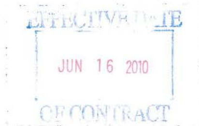
Date of final signature